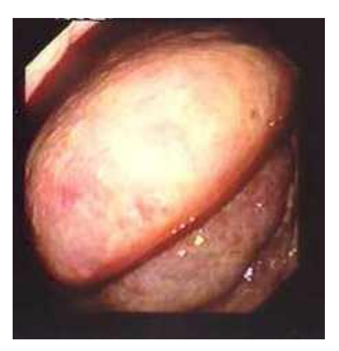
Figure 2 Endoscopic picture: A congested intestinal loop protruding through the stoma into the stomach.

Jejunogastric intussusception (JGI) was described in 1914 by Bozzi[5] in a patient with gastrojejunostomy. Eight years later this complication was also reported in a patient with Billroth II resection.[6] Subsequently, a large number of isolated cases and small series have been published and the reviews of the literature showed that less than 200 cases have been reported[1,2,7,8,9,10].