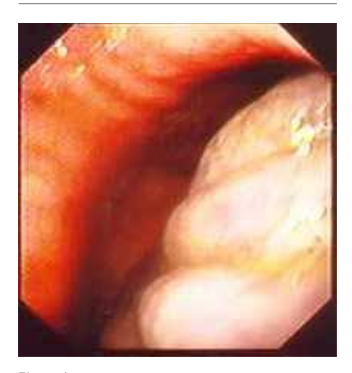
Figure 4 Endoscopic picture: Another view of a congested intestinal loop.