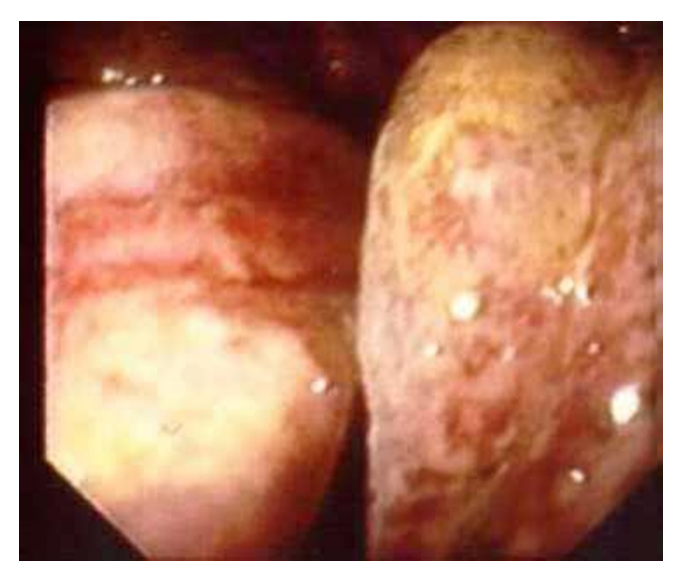
Figure 1 Endoscopic picture: A bulky, lobulated congestive mass with petechial hemorrhage is seen.

a bleeding duodenal ulcer. Postoperative recovery was uneventful and, since then, the only complaint of the patient was the feeling of an early postprandial gastric fullness. On physical examination there was a mildly distented abdomen, epigastric tenderness and, on deep palpation, a vague feeling of an epigastric mass. The usual laboratory investigation was unremarkable except of an elevated WBC (15610<sup>3</sup>/L). Emergency endoscopy disclosed a bulky, lobulated, congestive mass with petechial bleeding, protruding through the stoma into the gastric lumen, that occupied practically the anterior wall of the stomach and part of the greater curvature. The mass was sharply demarcated and the adjacent gastric mucosa was normal (fig. 1,2,3,4). An emergency CT scan of the abdomen was performed: it showed a distented stomach containing a non-homogeneous mass and a small quantity of ascitic fluid (fig. 5,6). The diagnosis of JGI was established and a laparotomy was performed. At laparotomy, the efferent loop was found intussuscepted in a retrograde way into the gastric lumen. Reduction of the JGI was performed without resection of the intussuscepted intestine, that was oedematous with serosal petechiae but absolutely viable. Postoperative recovery was uneventful and the patient was discharged home.