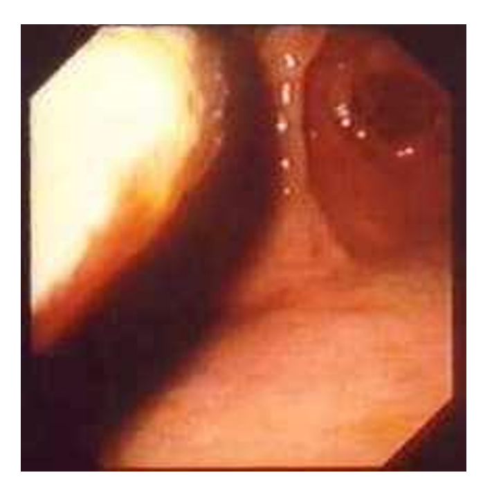
Figure 3 Endoscopic picture: Another view showing that the mass was sharply demarcated and the adjacent gastric mucosa was normal.