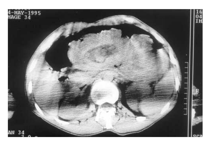
Figure 5 Emergency CT- Scan of the abdomen: Dilated stomach with intragastric non-homogeneous mass compatible with bowel loops.